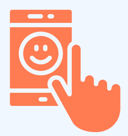
Overall ease of use

Multiple customers referenced important factors that led to their success with the platform such as: